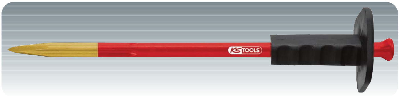
Pointed chisel with round shaft and hand grip, manufactured from carbon manganese silicon steel, coated with red powder lacquer, tip can be sharpened