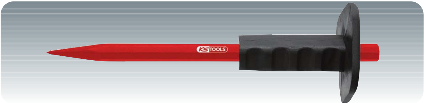
Pointed chisel with octagonal shaft, manufactured from carbon manganese silicon steel, coated with red powder lacquer