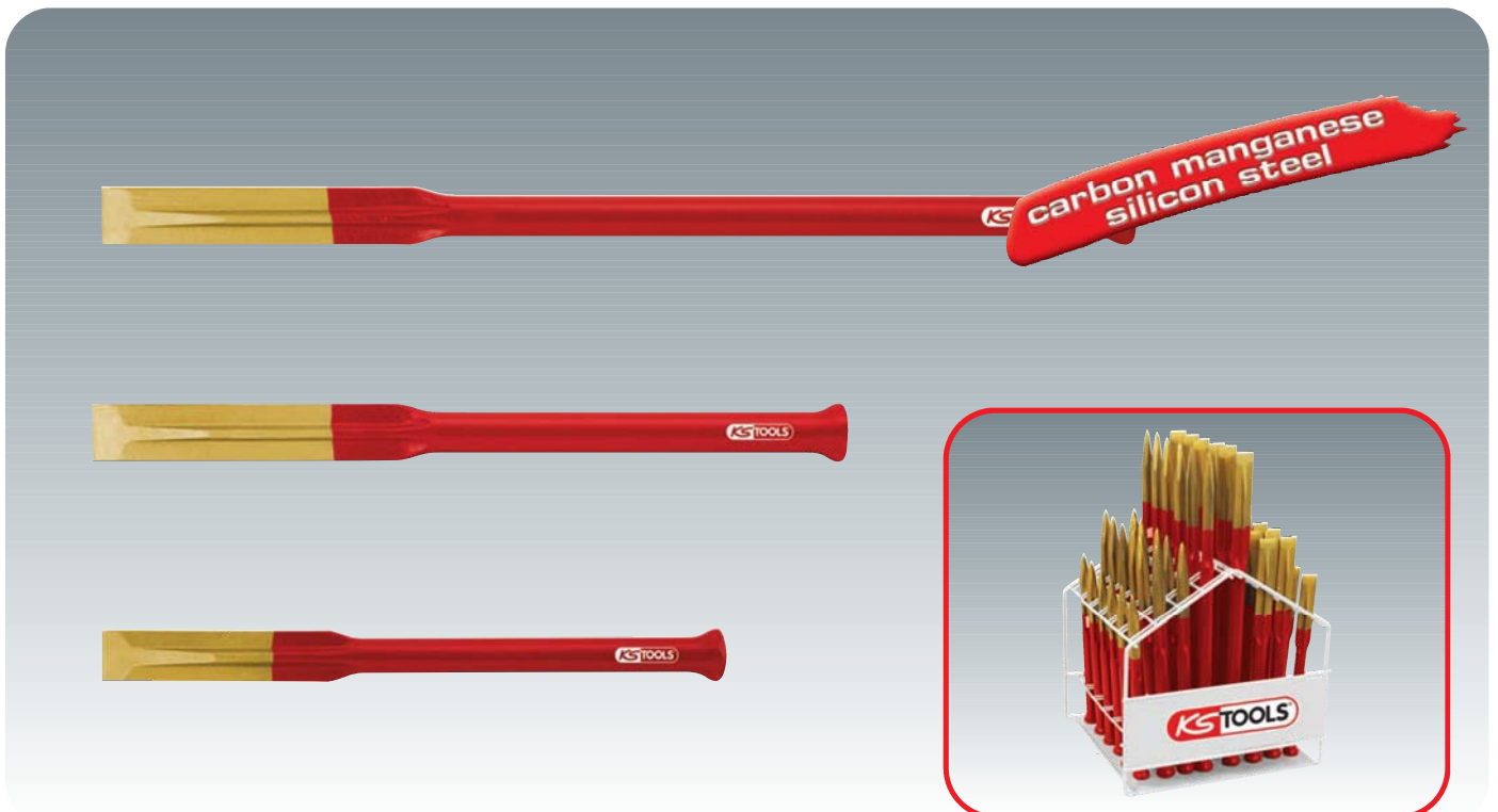
Flat chisel with round shaft, tip can be re-sharpened