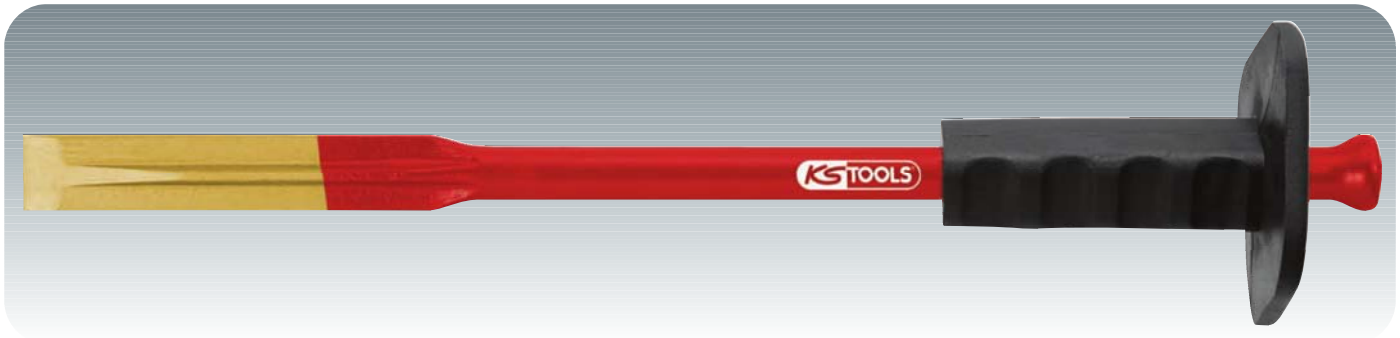
Flat chisel with round shaft and hand grip, manufactured from carbon manganese silicon steel, coated with red powder lacquer, tip can be sharpened