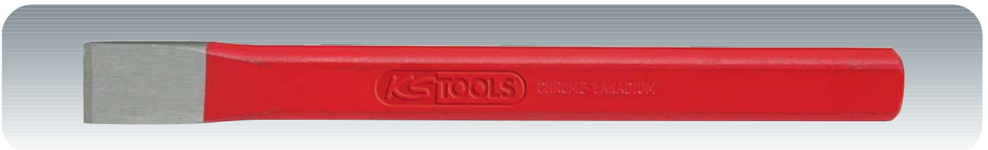
Flat chisel manufactured from carbon manganese silicon steel, coated with red powder lacquer, flat shaft