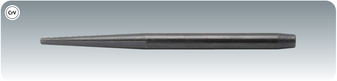
Centre punch, heavy duty