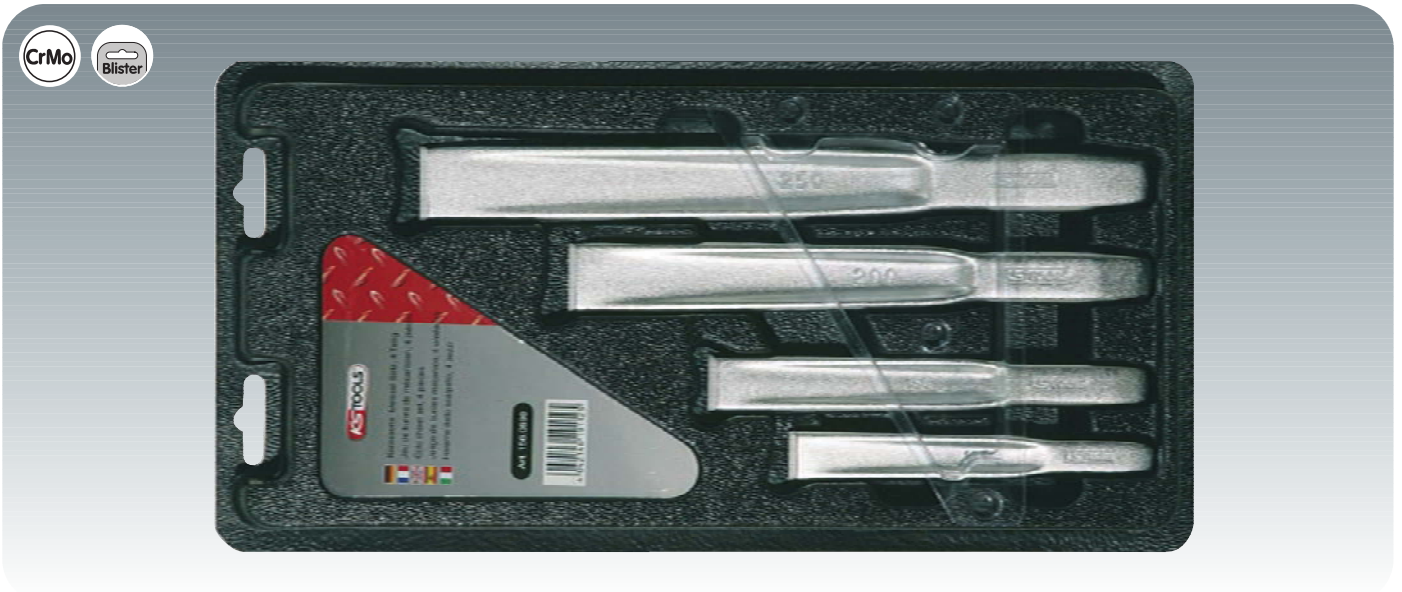
Flat chisel set, 4-pcs., chrome molybdenum steel, for work on metal, flat shaft