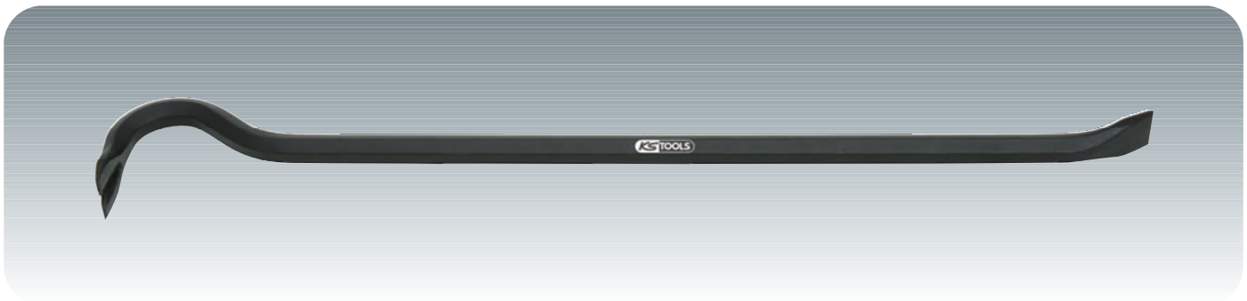
Crow bar, manufactured from forged and hardened steel, hexagonal, black powder coated