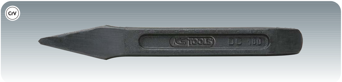
Cross chisel for working on metals, round shaft