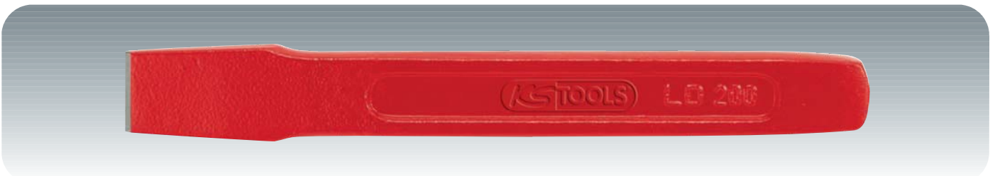
Flat chisel for metal for use on metals, manufactured from chrome vanadium molybdenum steel, flat shaft