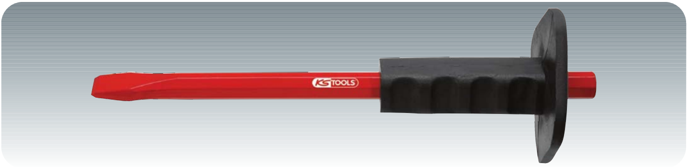
Flat chisel with octagonal shaft and hand grip, manufactured from carbon manganese silicon steel, coated with red powder lacquer.