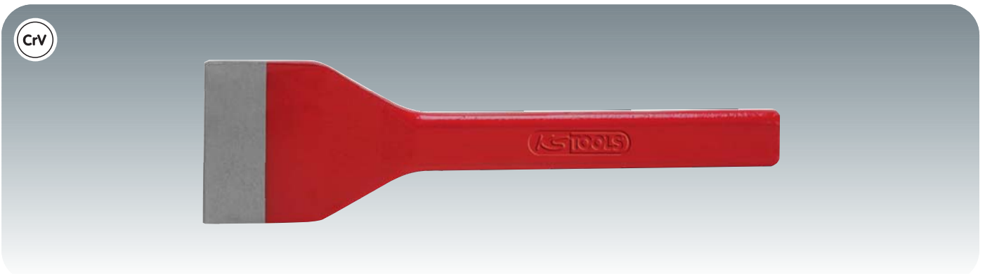
Wide flat chisel