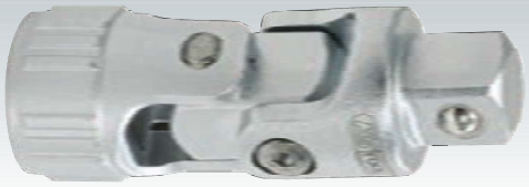
3/8" TURBOplus Universal joint, spring-loaded, screwed joint