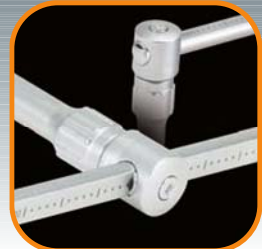
3/8" TURBOplus Sliding T-bar