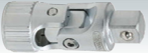
1/2" TURBOplus Universal joint, spring-loaded, screwed joint