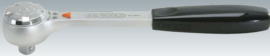
1/4" TURBOplus Ratchet