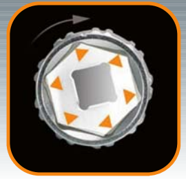
1/2" TURBOplus Sockets, length 38 mm