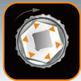
3/8" TURBOplus Sockets, length 30 mm