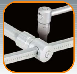
1/2" TURBOplus Sliding T-bar