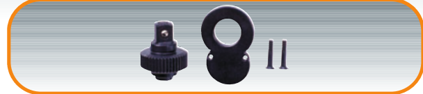
1/4" Repair kit for 144-teeth-ratchet

920.1400 TURBOplus Ratchet 1/4" : 145 1/4" - Reversible left-right with knurled wheel on ratchet head - 144-teeth, 74 Nm