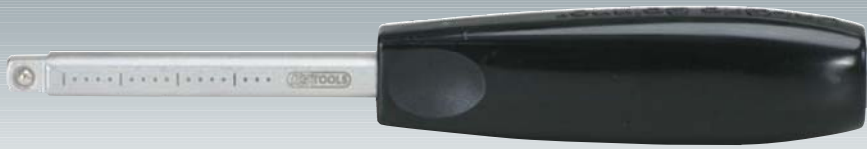
1/4" TURBOplus Spinner handle 1/4" with 1/4" drive