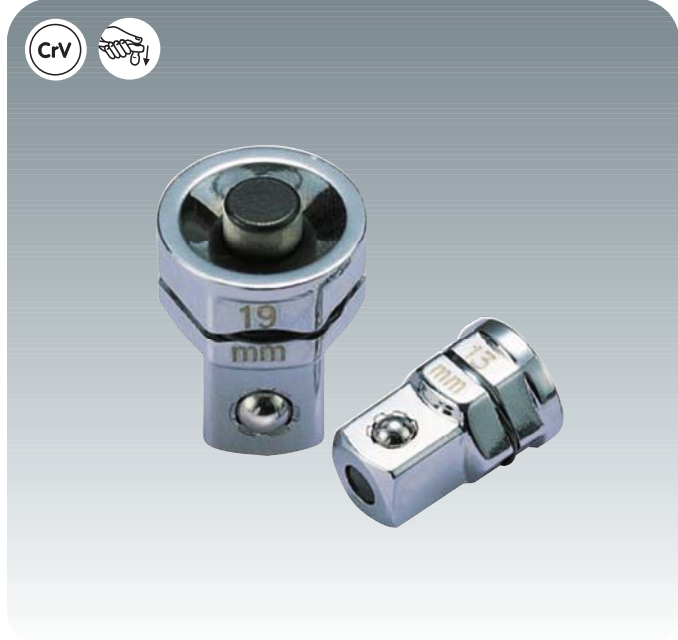
GEARplus® Socket adaptor, with quick release system, chrome plated, mirror polished