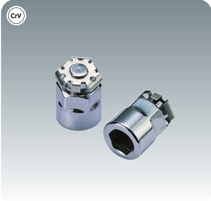
GEARplus® Bit adaptor, chrome plated, mirror polished