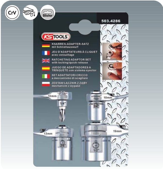
GEARplus® Adaptor set, 4-pcs., chrome plated, mirror polished