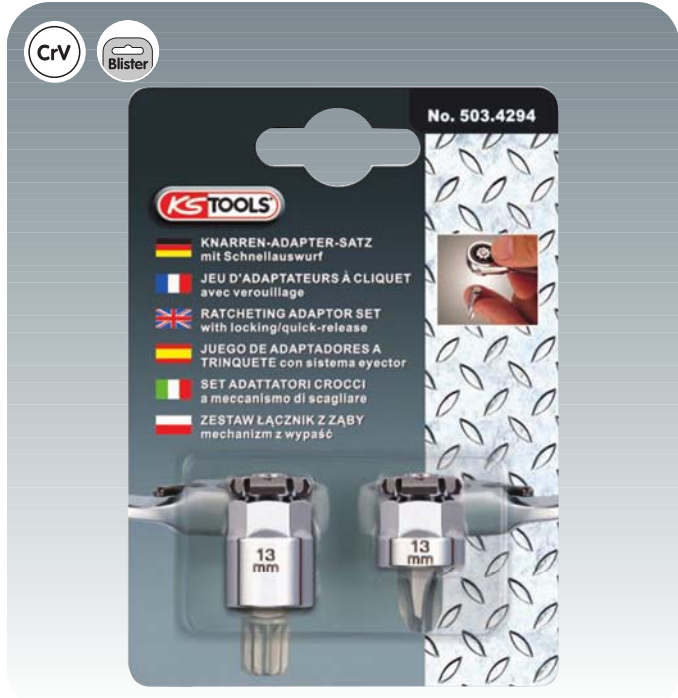
GEARplus® Bit adaptor set, 2-pcs. for 13 mm ratchet, chrome plated, mirror polished