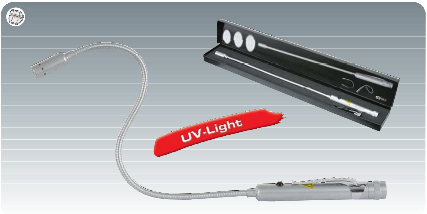
Diagnostic black light LED lamp, flexible, for locating leaks in air conditioning systems