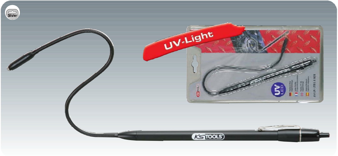
Diagnostic UV lamp, flexible, for locating leaks in air conditioning systems